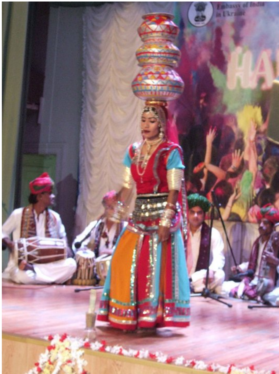
Performance of traditional music & dance by an ensemble from Rajasthan (India) at Holi celebration in Kyiv, March 20, 2011